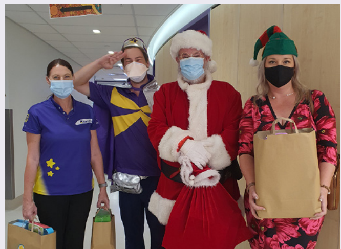
INPEX volunteered to help the Captains and Santa at the Star-Mas Christmas Party at the Starlight Express Room.

INPEX and Ichthys LNG have proudly supported Starlight Children's Foundation since 2012, most recently through Ichthys LNG's Perfect Day safety fundraising initiative, and we look forward to growing this partnership and further volunteering and engagement opportunities in coming years.