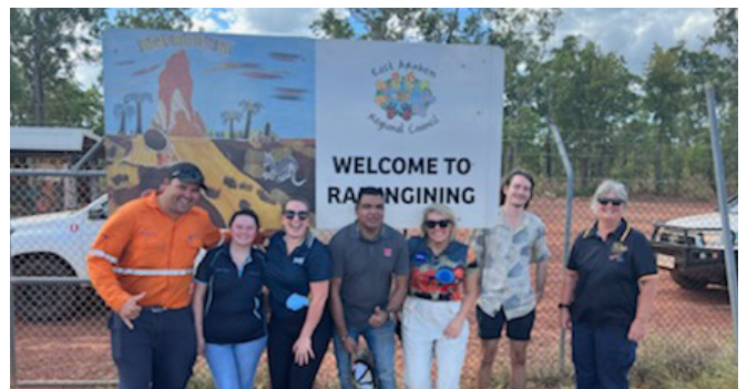
INPEX and contracting teams participated in a Career expo, hosted by ALPA in May.

Following the expo, two members of the community supported by ALPA, TRACE and INPEX, were successful in securing a traineeship at the Ichthys LNG onshore facilities.