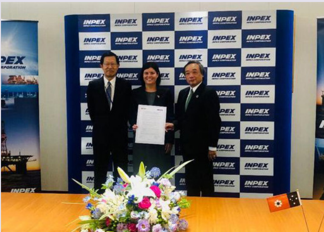
INPEX Toyko management team hosted the Hon Natasha Fyles MLA on her first overseas business trip as Chief Minister of the Northern Territory

Our medium-term business plan highlights INPEX’s specific goals from 2022 to 2024 and reflects the current management environment and social landscape.