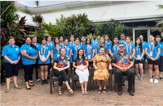
CSIRO's Young Indigenous Women's STEM Academy which took place in Darwin was a huge success. place in Darwin was a huge success.

Students travelled from all over the Northern Territory including Alice Springs, and Katherine to attend the three-day camp.