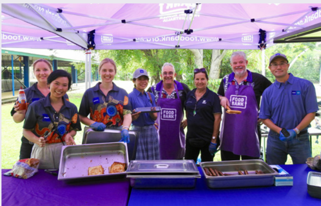
Foodbank and INPEX cooked up a big breakfast at Batchelor Area School.

In late 2022, INPEX Corporate Social Responsibility and Tokyo Sustainability team members teamed up with Foodbank NT to deliver breakfast at Batchelor Area School, approximately 100 kilometres south of Darwin. The team cooked more than 100 egg-in-a-hole and sausages for students and families at the school.