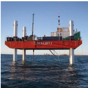
The jack-up barge will undertake drilling activities