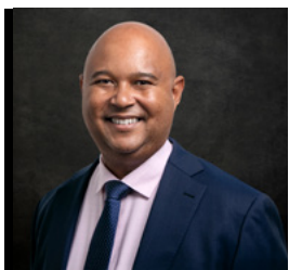
INPEX General Manager, Northern Territory

It has been another productive, challenging and yet satisfying year for INPEX in the Northern Territory.