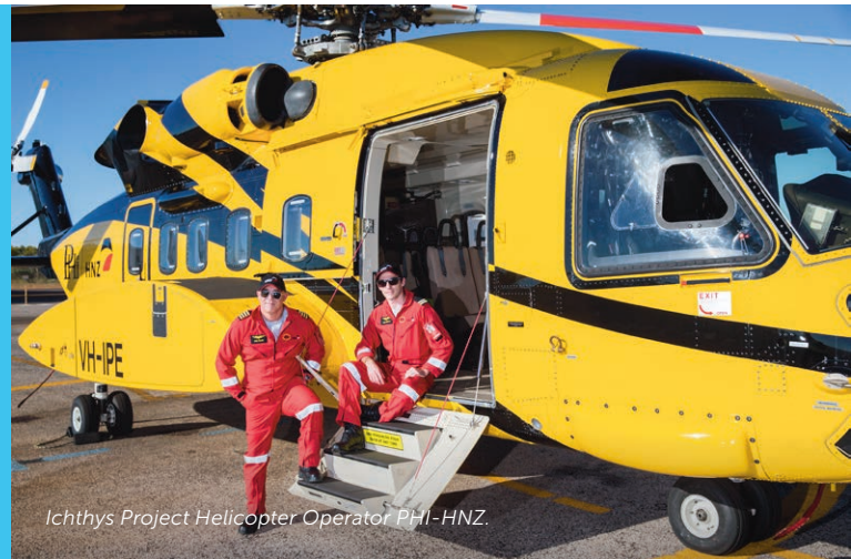
Ichthys Project Helicopter Operator PHI-HNZ.

The increased helicopter traffic has also brought economic benefits to the Broome community with Broome International Airport employing