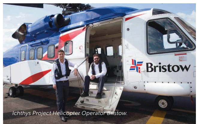
Ichthys Project Helicopter Operator Bristow.