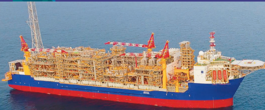
Ichthys Venturer moored in the Ichthys Field.