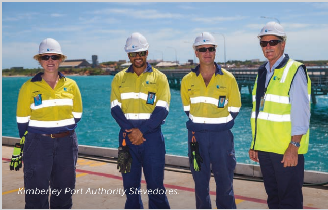
Kimberley Port Authority Stevedores.