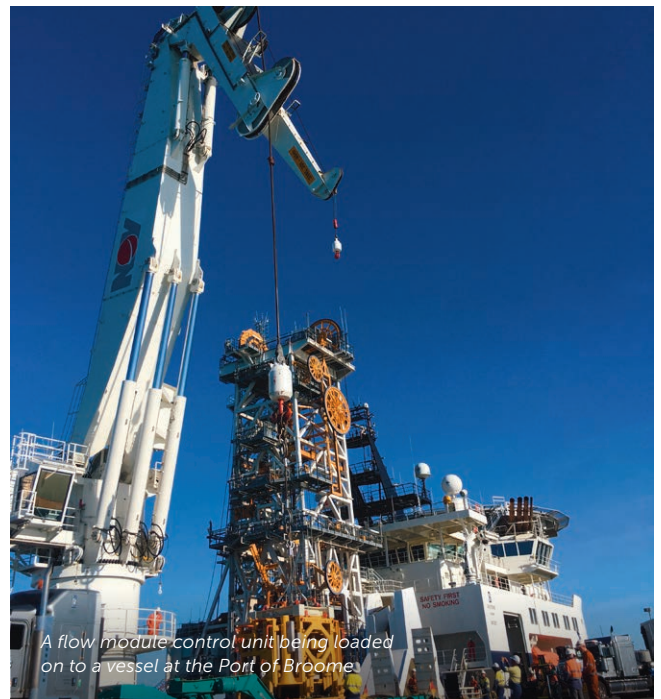
A flow module control unit being loaded on to a vessel at the Port of Broome.

In addition to locals, there are many skilled workers who reside in Broome, including pilots, engineers, logistics specialists and INPEX supervisors. Many of these workers use Broome services such as hire vehicles, long stay accommodation or rental properties and purchase a wide variety of goods and services all year round.