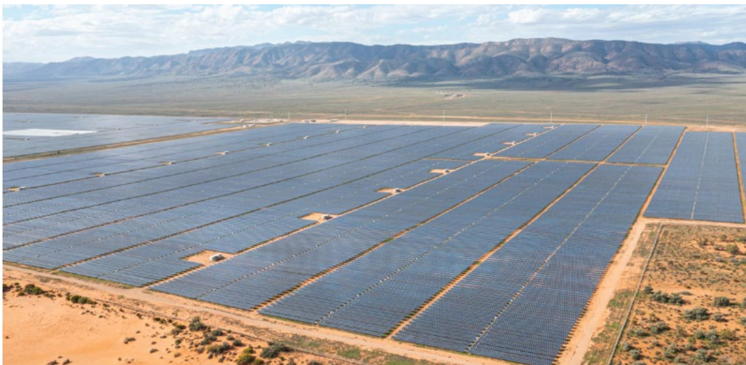
EGPA's Bungala Solar Farms 1 and 2 in South Australia have a total capacity of 275MW