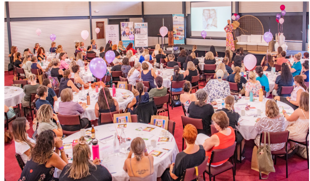
2021 Women's Leadership Forum