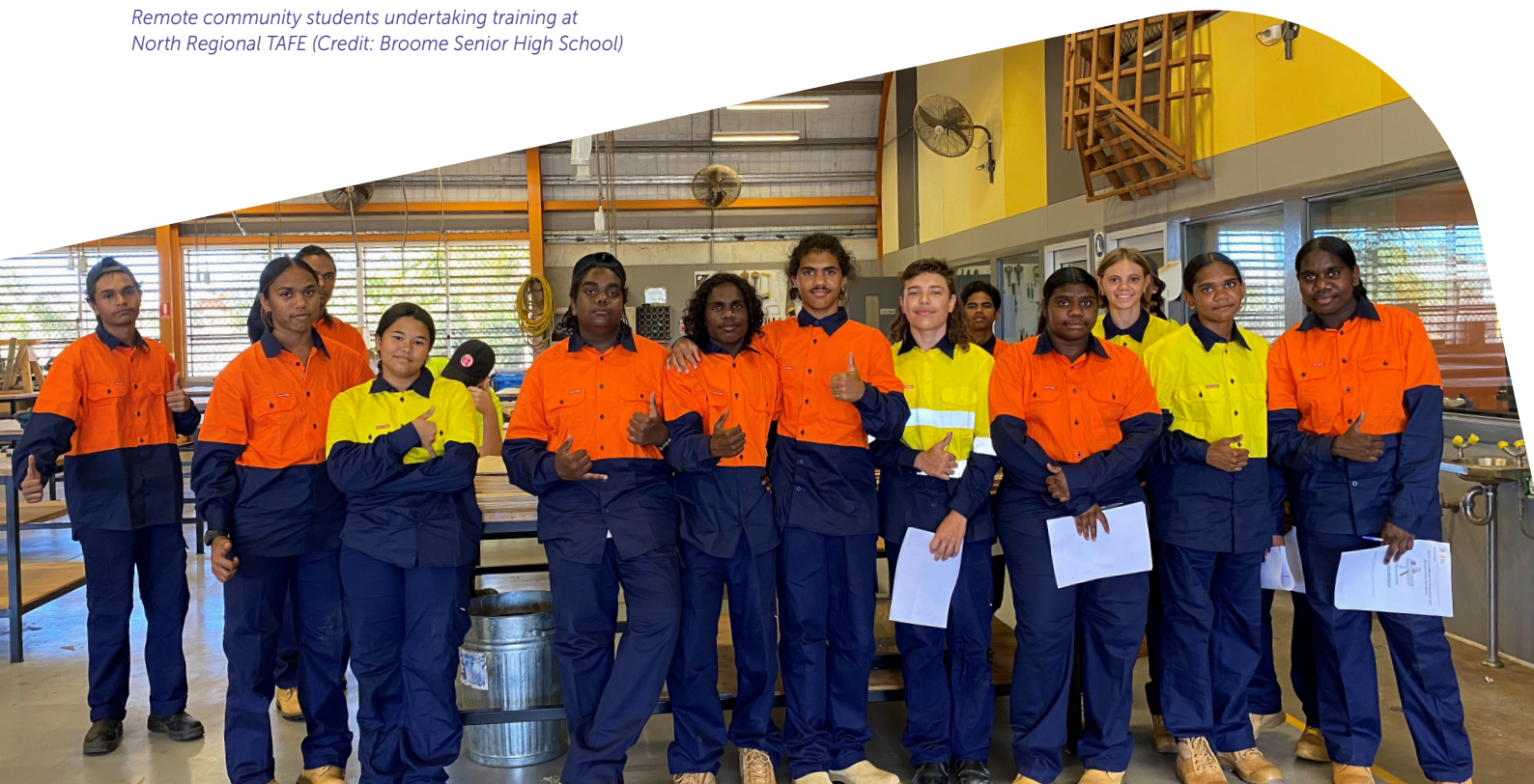
Remote community students undertaking training at North Regional TAFE

The PPE kits, comprising workwear, boots, gloves and safety glasses, will be maintained by the high school VET departments in each jurisdiction to be provided to students when they visit for training.