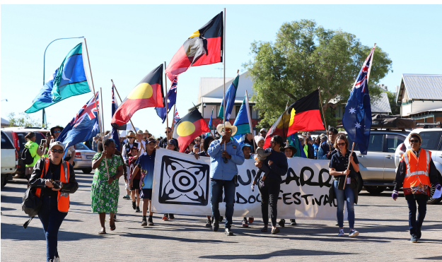
2021 Kullarri NAIDOC Festival