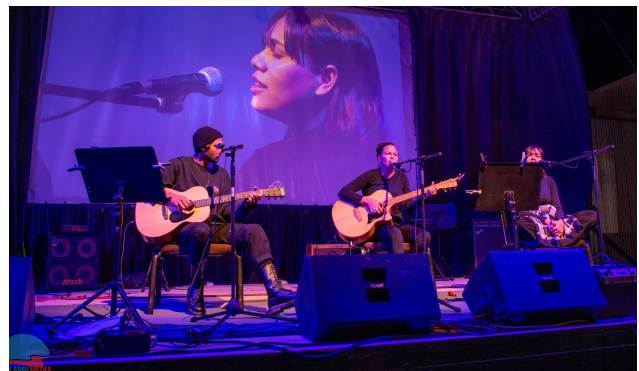
Kimberley Indigenous Performing Arts Showcase (ATOB)