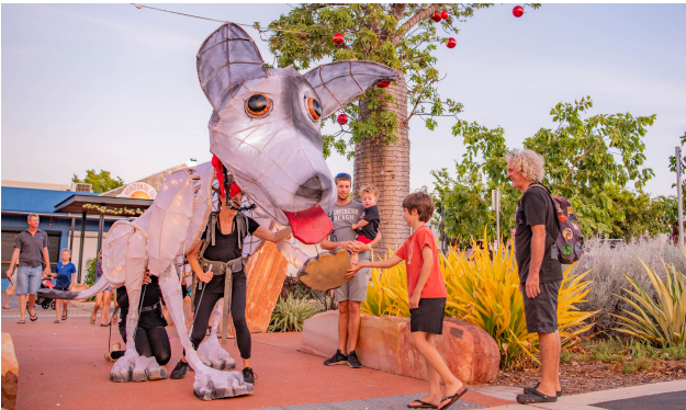
2020 Chinatown Christmas Trails

Some of the events supported since our last update include the 2020 Shire of Broome Chinatown Christmas Trails, 2021 Women's Leadership Forum, Kullarri NAIDOC Festival and A Taste of Broome Festival (ATOB).