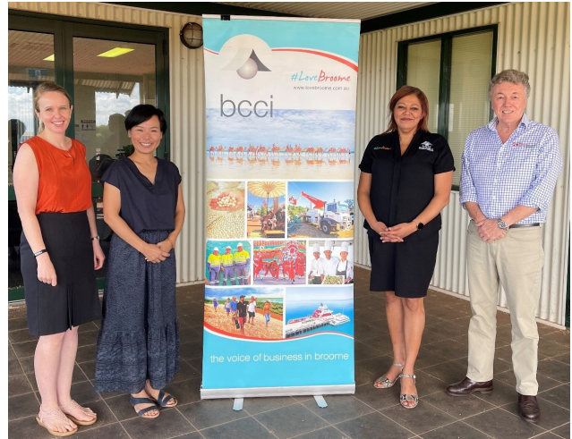
INPEX and BCCI representatives commemorated the new partnership in June

We look forward to working with BCCI on these initiatives and other opportunities that may come to light.