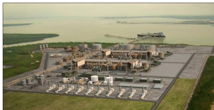
Ichthys LNG Plant, Darwin (image)