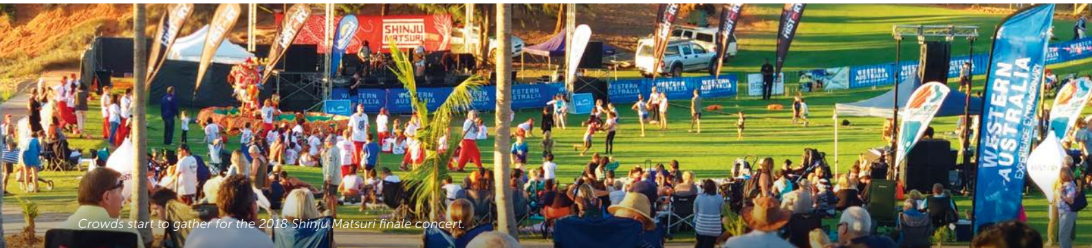
Crowds start to gather for the 2018 Shinju Matsuri finale concert.

The INPEX-operated Ichthys LNG Project is a proud supporter of these community initiatives and other community organisations, as part of our commitment to work with and support businesses and community partners across the Kimberley region.