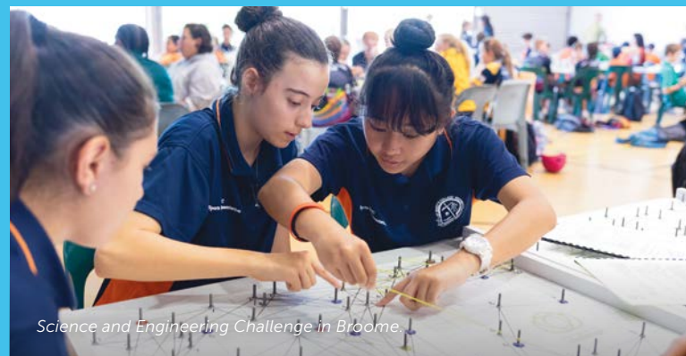
Science and Engineering Challenge in Broome.

The Ichthys LNG Project has also provided funding for mentoring support to Aboriginal and Torres Strait Islander female students at the Broome Girls Academy through Role Models and Leaders Australia.