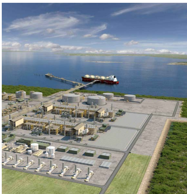
Ichthys LNG Plant, Darwin (image)