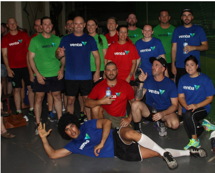
Above: Winning Ventia players and their supporters.

The sixth Ichthys Project Onshore LNG Facilities' Subcontractor Sports Challenge has attracted the most ever participants, who along with their families and friends, filled up the Top End Indoor Sports Centre in Woolner last Saturday.