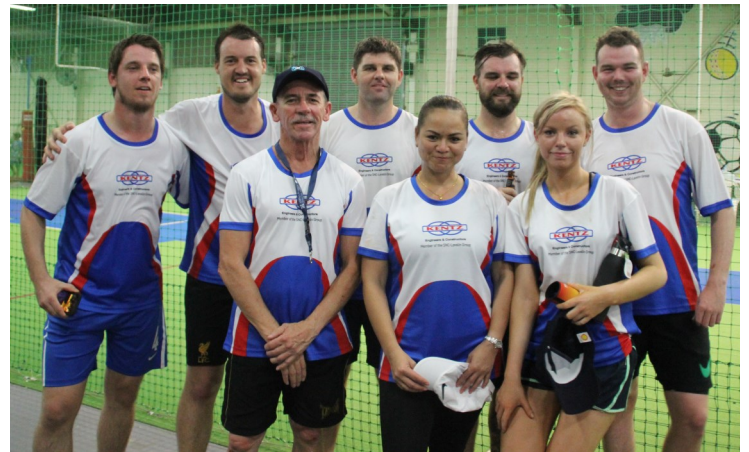
Below: Kentz team members.

Previous challenges have tested Project workers' prowess in rugby 7s, touch rugby, netball, volleyball and indoor cricket.