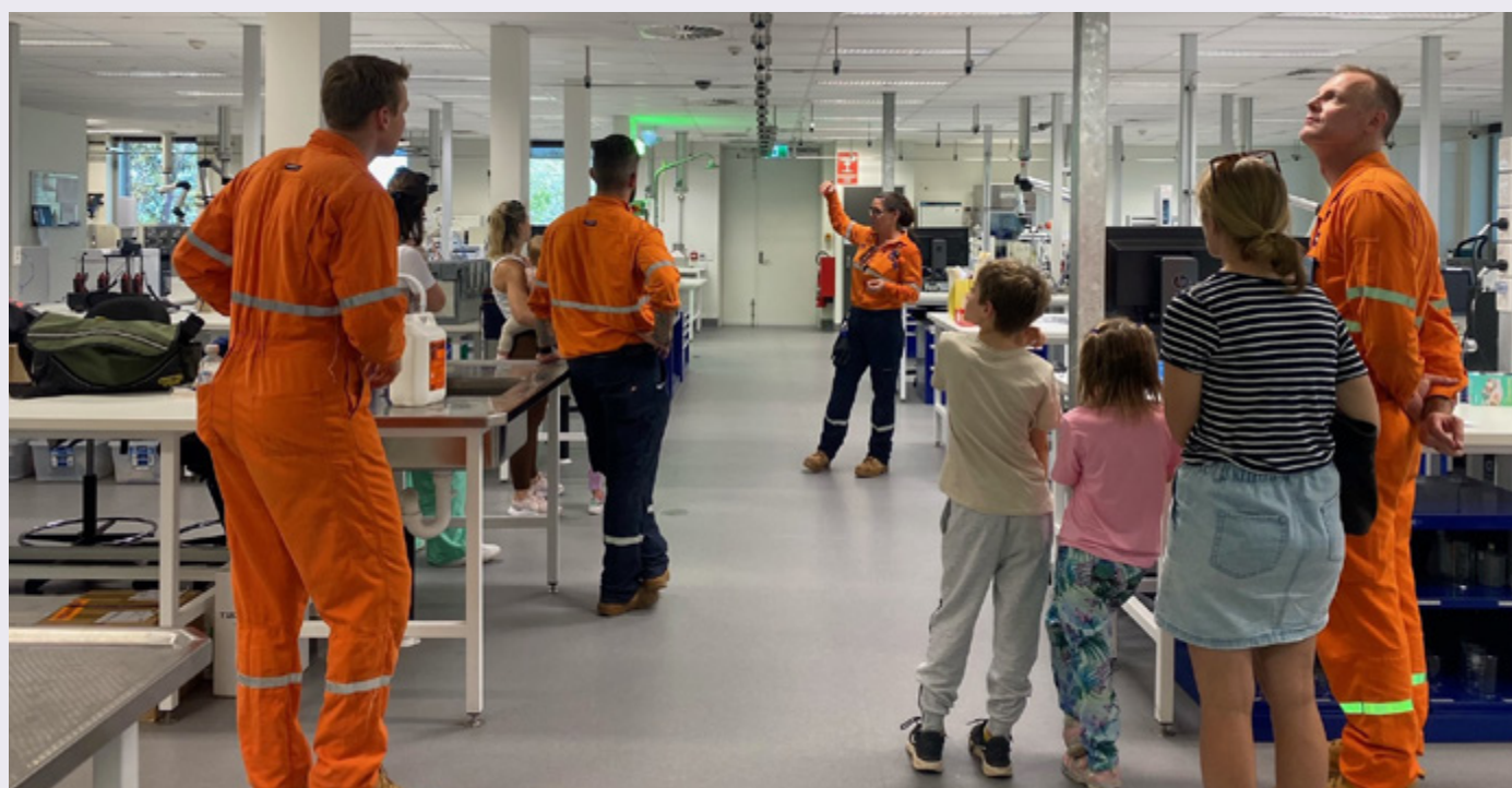
Team members from Ichthys LNG and the Offshore Logistics Base enjoy showing their families their workplaces.