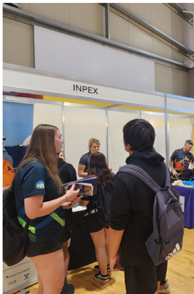
School students across the Territory visit the INPEX stand at the Darwin Careers Expo.

INPEX and our contractors were delighted to have connected with so many bright minds at the expo!