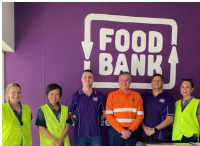
Staff from INPEX and Ichthys LNG, tour the new Foodbank NT hub, donating non-perishable items for distribution.

The INPEX-led Ichthys Joint Venture continued its support for the Foodbank SA & NT School Breakfast Program playing a vital role in addressing the cost-of-living crisis affecting many households in the Territory.