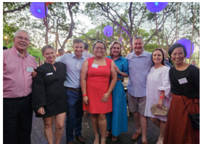
Members from INPEX Australia and the Australian Japanese Association of the Northern Territory enjoy the Darwin Festival stakeholder event.

To celebrate the festival, INPEX hosted a special stakeholder event offering a wonderful opportunity to give back to contractors, staff, and community partners including Anglicare NT, the Indigenous Land and Sea Corporation, AFL NT, Charles Darwin University, MAGNT, Basketball NT, Chamber of Commerce NT, Energy Club NT and the Australian Japanese Association of the Northern Territory (AJANT).