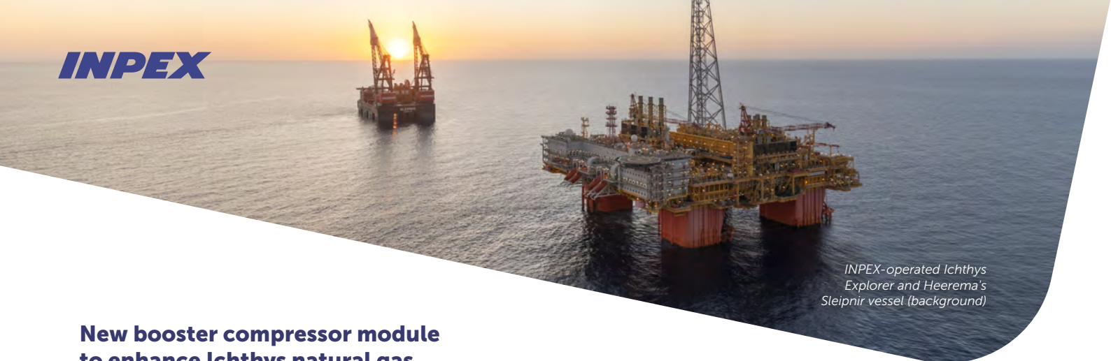
INPEX-operated Ichthys Explorer and Heerema's Sleipnir vessel (background)