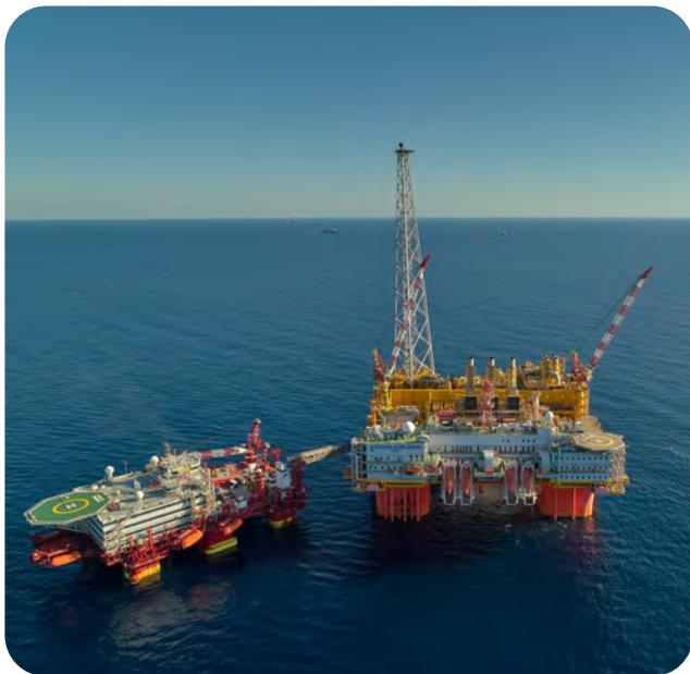
Floatel International's Floatel Triumph (left), alongside the Ichthys Explorer.

The Ichthys Explorer central processing facility (CPF), located approximately 220 kilometres off the Kimberley coast, has recently welcomed a significant addition, with the arrival of a 4,800-tonne booster compressor module (BCM).