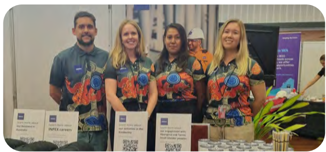
Our INPEX team at the 2024 West Kimberley Careers Expo.

We were also pleased to participate together with our helicopter services contractor, PHI Aviation, in the Stars Foundation 'Futures Forum', which connected year 11 and 12 participants of their Broome Senior High School program to local organisations who could provide more information on the types of jobs and ATAR and VET career pathways in their industries.