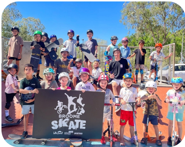
Broome Youth Skate Festival.