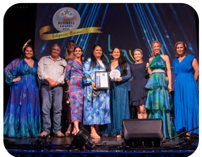
Love Broome 2024 Business Awards.