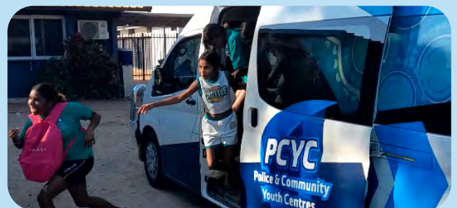
The new Broome PCYC commuter van dropping off participants at PCYC.