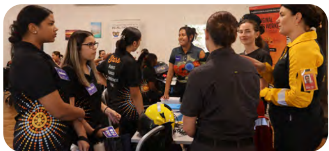
INPEX and PHI Aviation personnel participated at the Stars Foundation 2024 Broome Futures Forum.