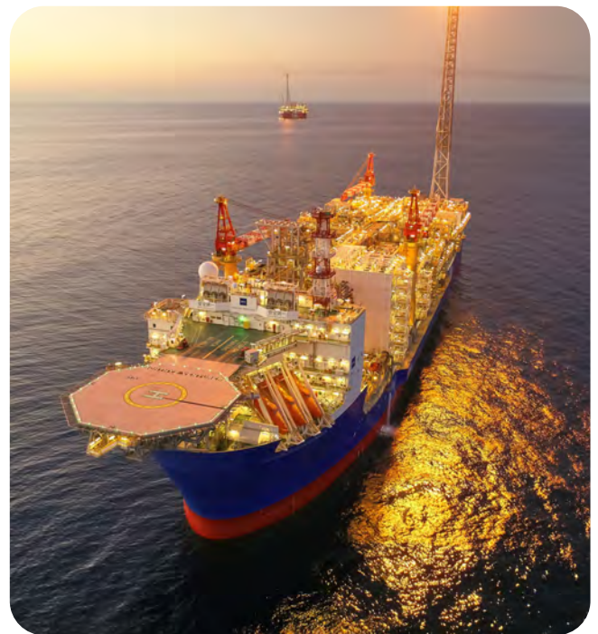
Ichthys Venturer at sea.