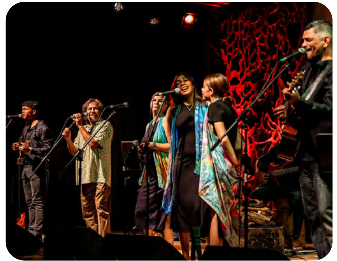
A Taste of Broome – Raised in Big Spirit Country.