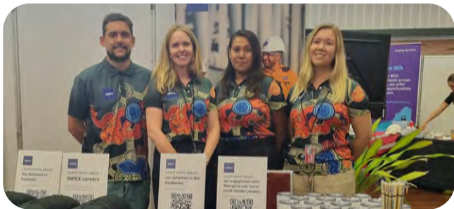
Our INPEX team at the 2024 West Kimberley Careers Expo.

We were also pleased to participate together with our helicopter services contractor, PHI Aviation, in the Stars Foundation 'Futures Forum', which connected year 11 and 12 participants of their Broome Senior High School program to local organisations who could provide more information on the types of jobs and ATAR and VET career pathways in their industries.