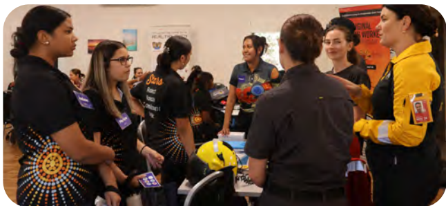
INPEX and PHI Aviation personnel participated at the Stars Foundation 2024 Broome Futures Forum.