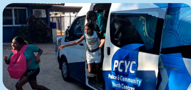
The new Broome PCYC commuter van dropping off participants at PCYC.