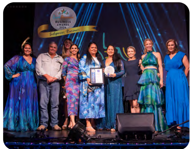
Love Broome 2024 Business Awards.