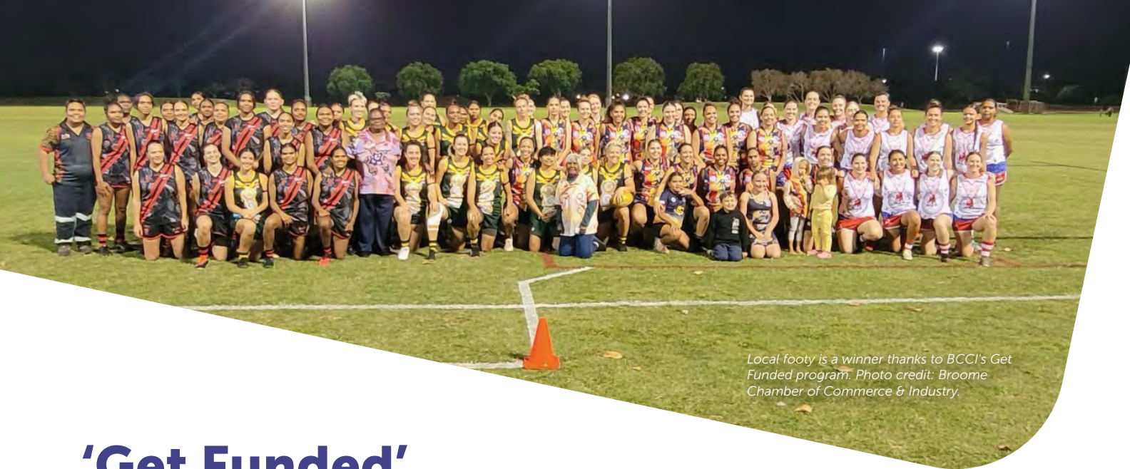
Local footy is a winner thanks to BCCI's Get Funded program.