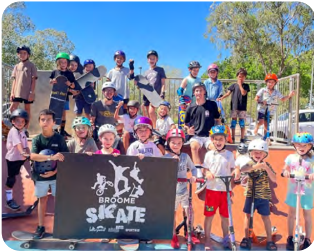
Broome Youth Skate Festival.