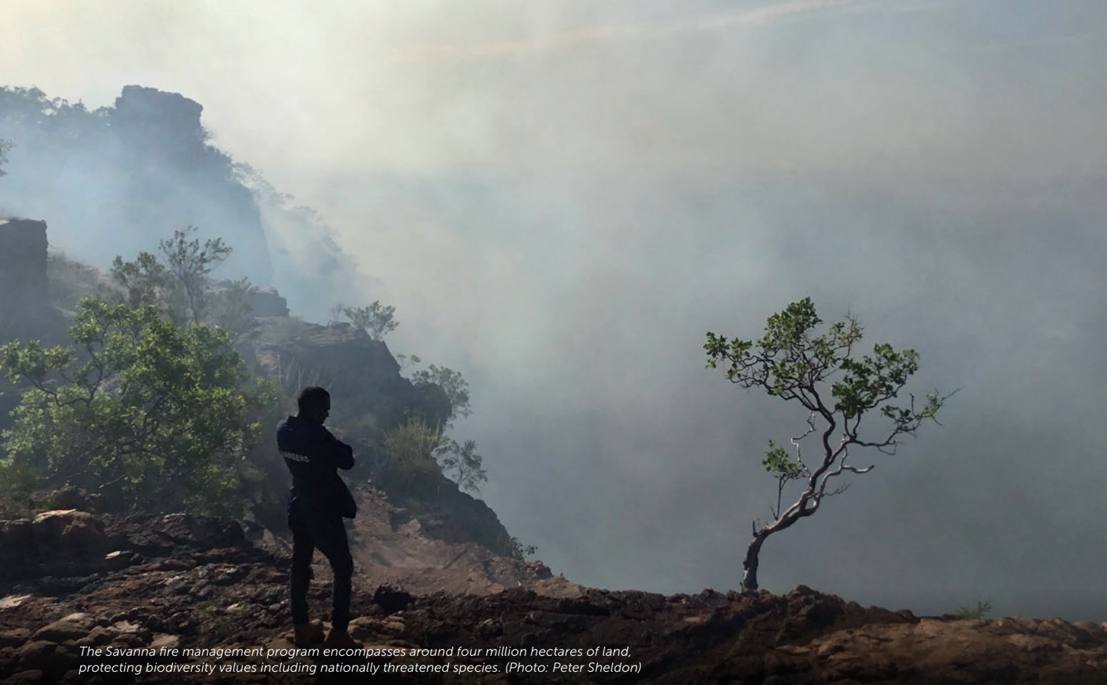
The Savanna fire management program encompasses around four million hectares of land, protecting biodiversity values including nationally threatened species.