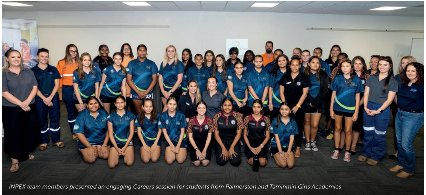
INPEX team members presented an engaging Careers session for students from Palmerston and Taminmin Girls Academies.

In the second half of 2020, as planned education programs resumed, a team of volunteers and mentors from INPEX rolled up their sleeves to support a range of school programs delivered by Engineers Australia Northern, Role Models and Leaders Australia and the Australian Resources and Energy Group (AMMA).