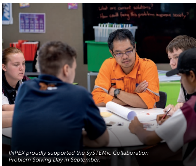
INPEX proudly supported the SySTEMic Collaboration Problem Solving Day in September.

A team of activity coaches and role models from INPEX assisted with the program and the schools were gifted a STEM pack with Edison robots, snap circuits and Turing Tumblers.