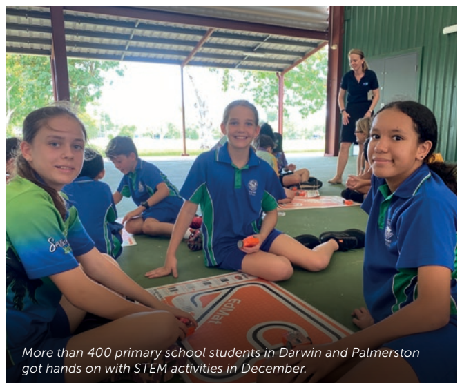
More than 400 primary school students in Darwin and Palmerston got hands on with STEM activities in December.