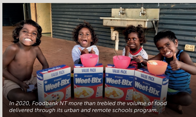
In 2020, Foodbank NT more than trebled the volume of food delivered through its urban and remote schools program.

As the Northern Territory's leading food relief agency, Foodbank NT distributes the equivalent of more than 1,000 meals to Territorians in need every day through 122 charity and NGO affiliates.