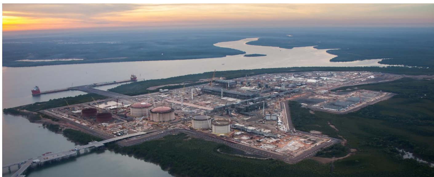
A recent aerial view of the Ichthys Project Onshore LNG Facilities at Bladin Point as construction work ramps up.