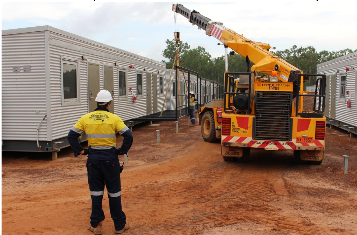
Top End Development Services employed 130 people while installing verandahs at Manigurr-ma Village construction site.