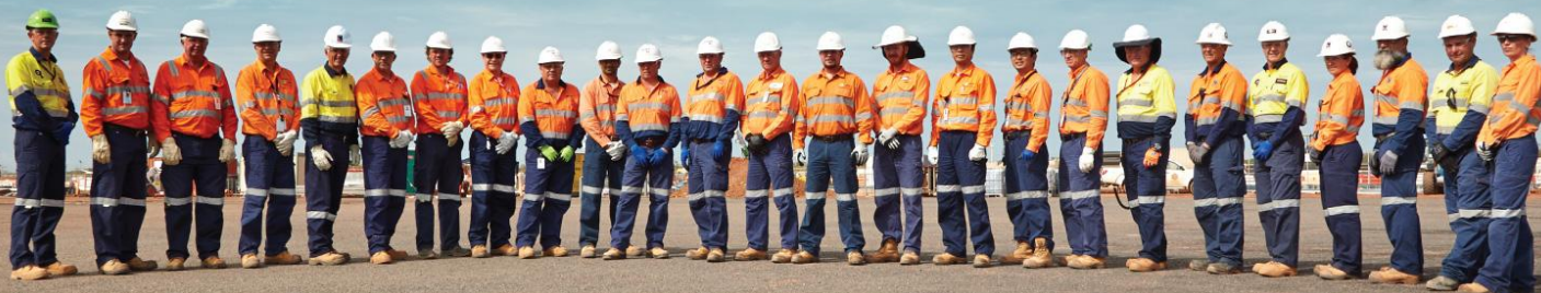
Incident and Injury Free Leadership Committee

COMMITTED TO AN INCIDENT AND INJURY FREE WORKPLACE