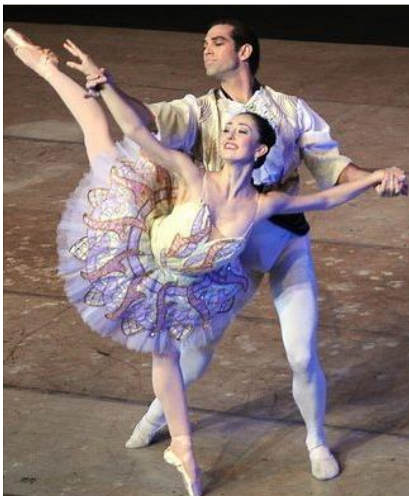
JKC is a proud sponsor of this weekend's performance of Cinderella by the Palmerston Association for Dancing.