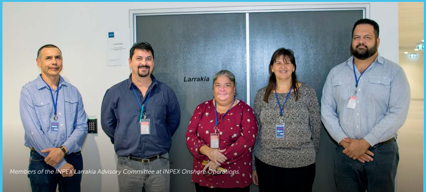
Members of the INPEX Larrakia Advisory Committee at INPEX Onshore Operations.